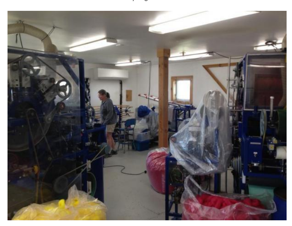
The North Light Fibers mill where Philips brand LED lights were installed as part of OER's program.

Risom noted that it was "too early to measure" the savings from the program and installation of the LED lights, but said that he would recommend the EEI program to other island businesses.