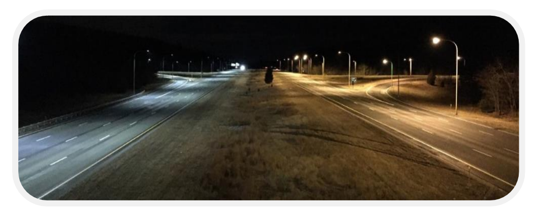
I-295 Exit 7 – Smithfield (Left side of the highway are LEDs during conversion process)

Through this initiative, Rhode Island is poised to become the first state to shift all state-owned highway streetlights to new light-emitting diode (LED) technology, which will lead to substantial energy cost reductions and improve the quality of lighting across our roadways.